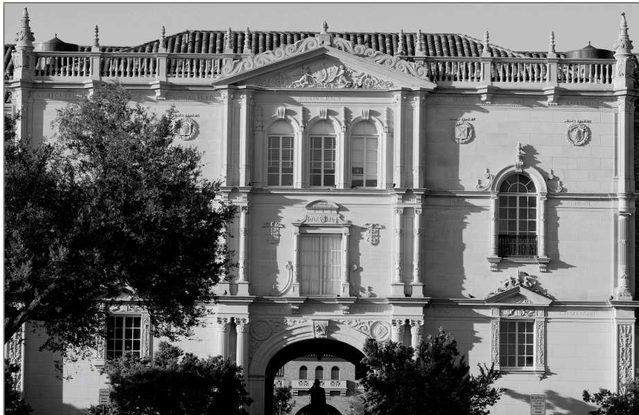
Texas Tech Administration Building

School of Art, Landmark Arts Speakers Fund